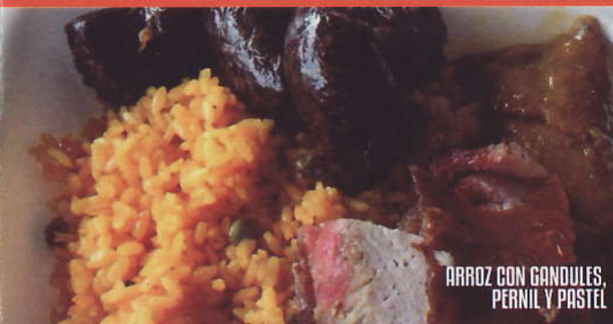
ARROZ CON GANDULES, PERNIL Y PASTEL

Precios Sujetos a cambios sin aviso previo | Prices are subject to changess without notice